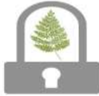
Protect the SSSI