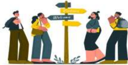
Visitor Welcome and Orientation