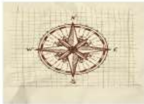
Trails, Routes and Signage