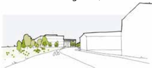
Approach from Parkview Court

The detail for the feasibility study can be found in the Council Report from 14 December 2023 (Item 11. East Dunbartonshire Forward in Partnership – Update to Financial Planning & Transformative Agenda).