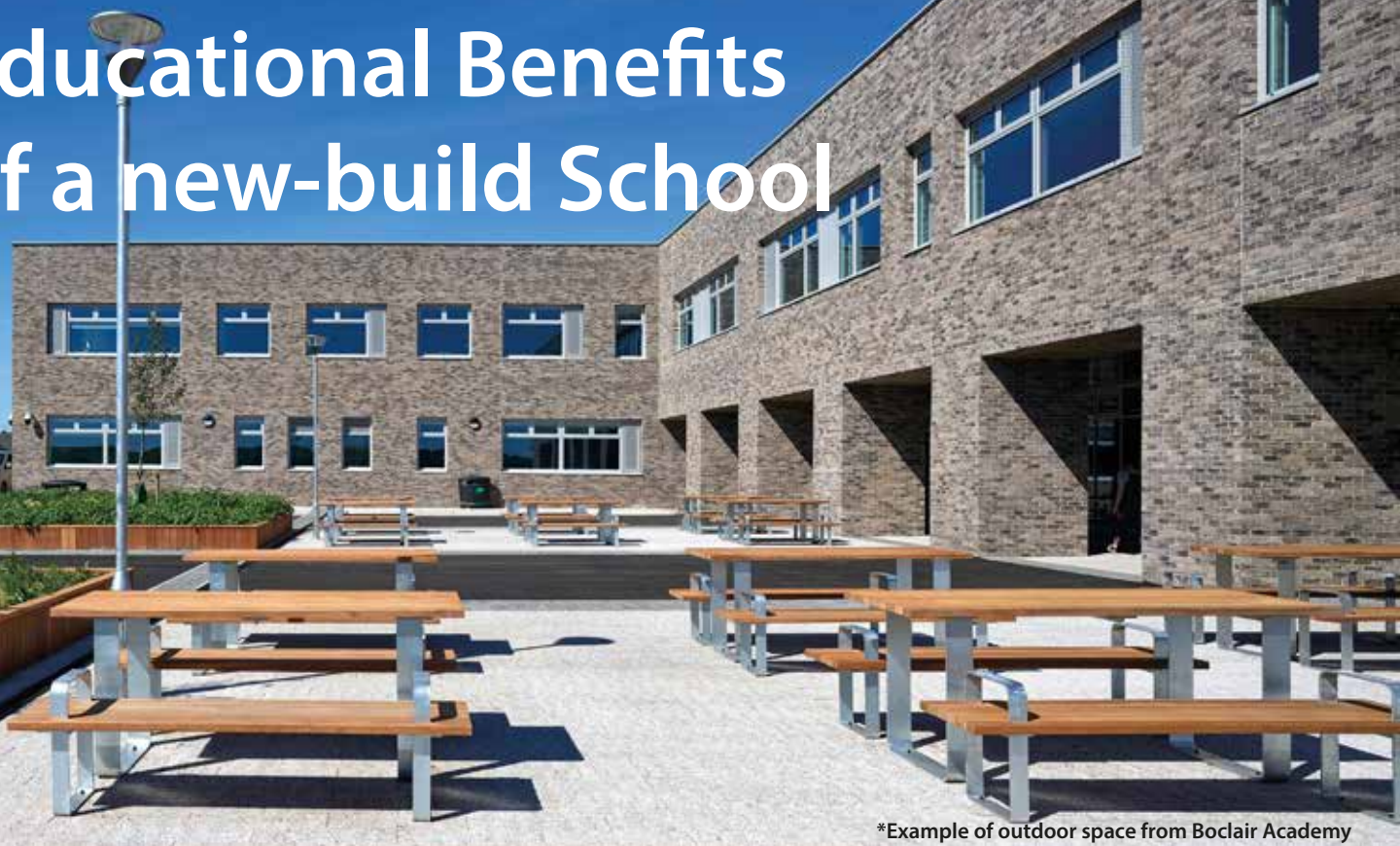
*Example of outdoor space from Boclair Academy