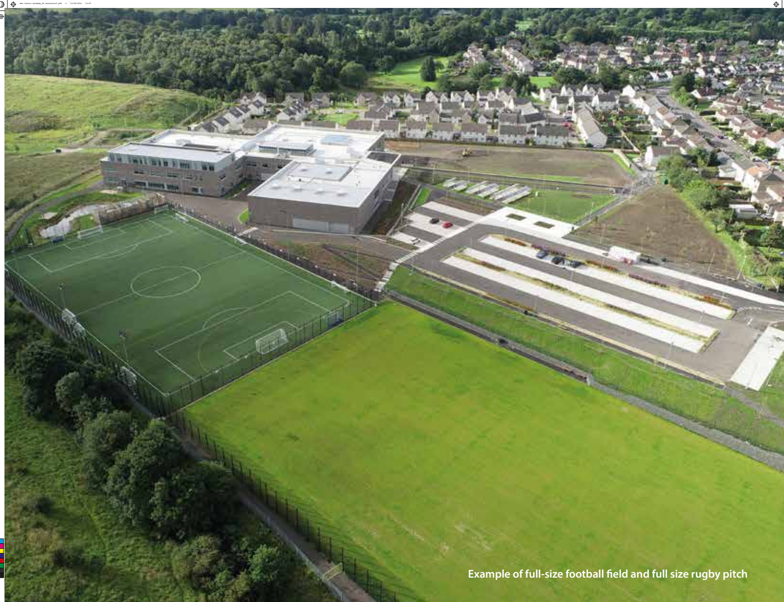
Example of full-size football field and full size rugby pitch