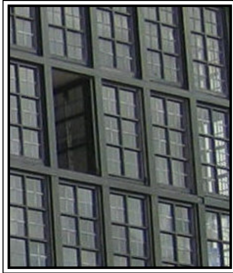
THE TEA COSY

A detailed 'walk over' survey was carried out in July 2005, complimented by a 'desk study' analysis of historic maps, local history documents and other archived material.