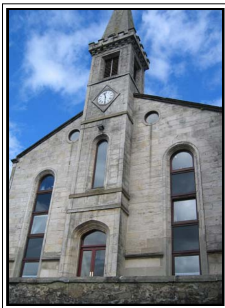
OLD PARISH CHURCH

East Dunbartonshire has 12 Conservation Areas and 25 Townscape Protection Areas.