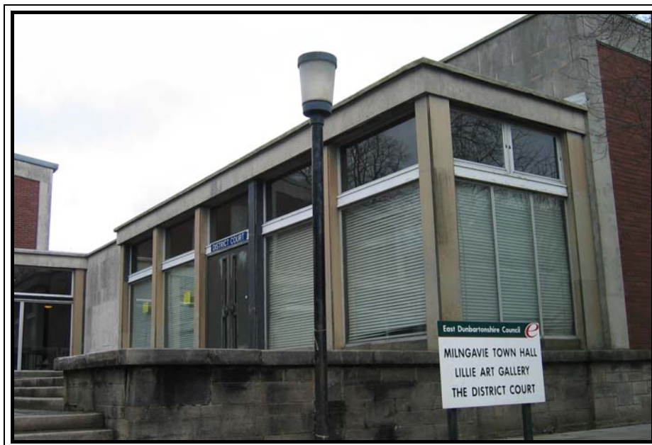
MILNGAVIE TOWN HALL, ETC.

1. Old Parish Church This remains the most prominent structure in the town centre on account of the elevated site, scale and design, as no doubt intended. The diamond shaped moulding framing the clock includes a date inscription MDCCCXLI (1840). Ecclesiastical use ceased in 1906 with the expanding congregation relocating to the new St. Paul's church on Strathblane Road. Subsequent municipal and civic defence uses rather undermined the dignity of the building. Following a period of vacancy in the mid 1980's conversion to five maisonette flats was approved in June 1989. Original architectural features include the pyramidal tapering stone spire atop a square stone belfry, with louvred openings, crenellated parapet and round and arched window and door openings.